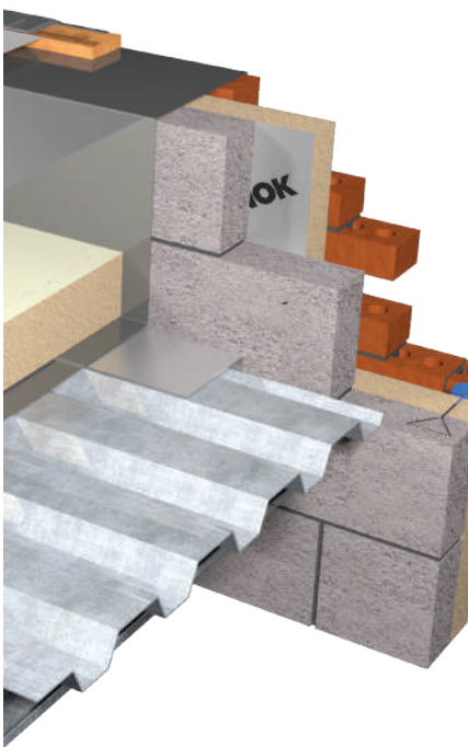
Flat roofs: MFR-DPFR on metal deck