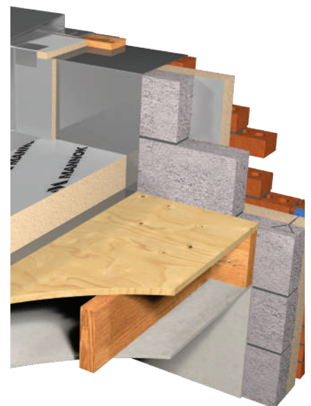
Flat roofs: MFR-FFR on timber deck