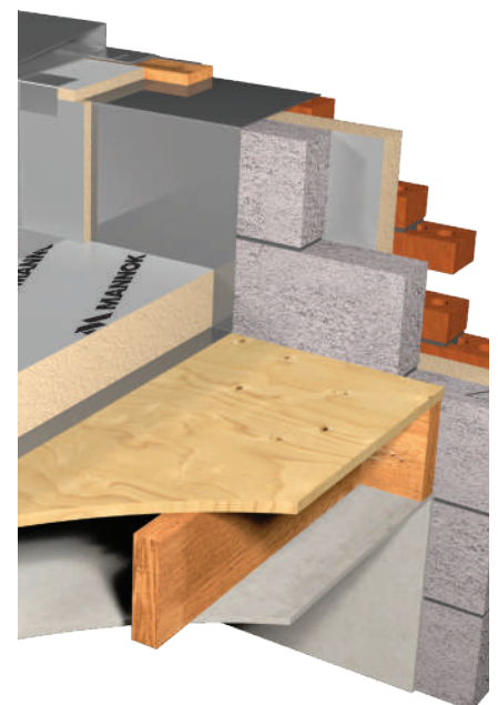
Flat roofs: MFR-GFR on timber deck